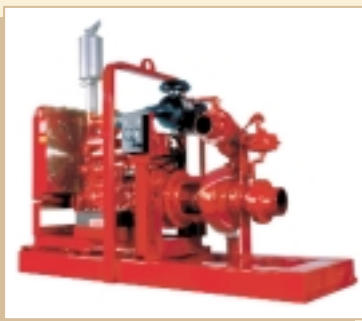
8" High Pressure Jet Pump.