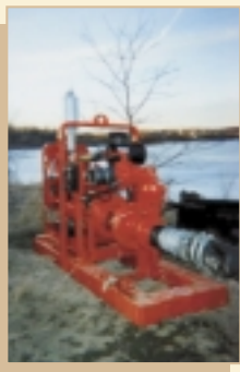
Jet Pump used for jetting well-points or casings.