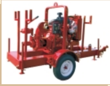
4" High Pressure Trailer Mounted Jet Pump.