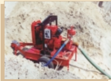
6" High Pressure Jet Pump used for a dewatering project.