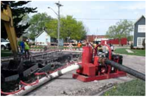
Wellpoint dewatering system at a sewer repair project in Valley, Nebraska.