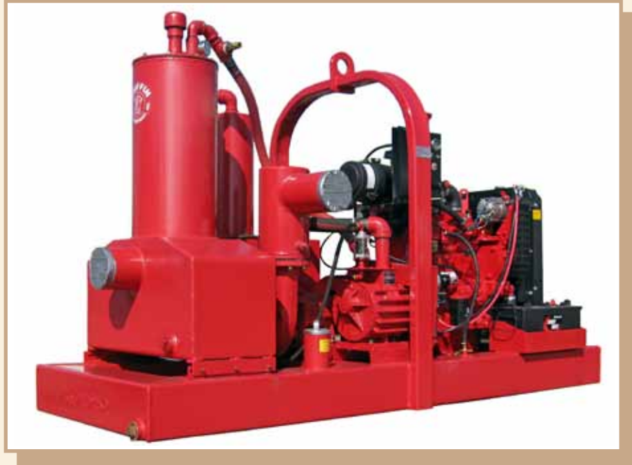
A Griffin 6 inch diesel driven Wellpoint Pump

Griffin's Vacuum-Assisted Wellpoint Pumps are available in 4", 6", 8" and 10" models. These pumps are designed for handling high volumes of water and air. The pump automatically primes and reprimates at suction lifts of 25 ft. or greater.