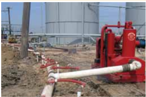
Wellpoint dewatering system in use at a pond excavation in Alvin, Texas.